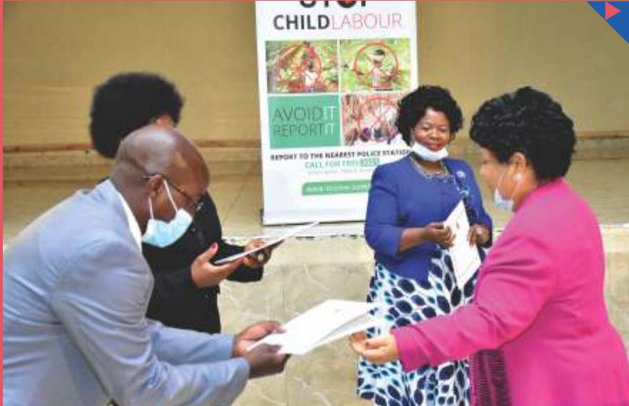
Former Malawi's Minister of Labour, Skills and Innovation Ms. Lilian Patel (far right) during the launch of National Action Plan on Child Labour.

Meanwhile, Ms. Patel stated that: “the closure of schools coupled with loss of jobs and other means of livelihood for the adult breadwinners is putting children at a greater risk of falling into child labour. They are obliged to engage in economic activities to fill the gap of dwindling family incomes, and have to carry out numerous household chores while adults go out to search for food and other basic household needs. Girls face a greater risk of child marriage and other risks the longer they remain out of school”.