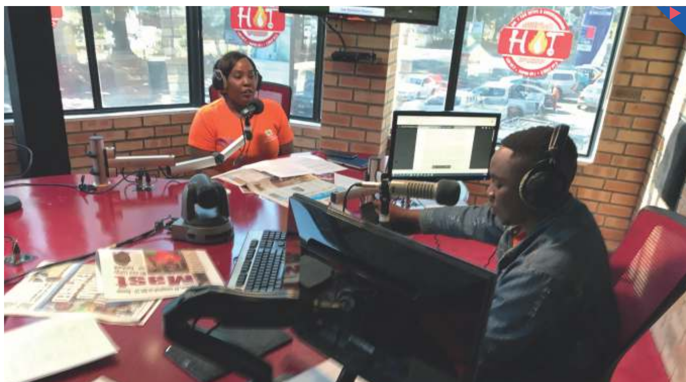
Government, Civil Society and Social Partners dialogue during a radio series of 'Social Protection in the Times of COVID-19'.

He shared his concern on the lack of information on the informal economy and further highlighted that COVID-19 creates an opportunity to invest in research and develop databases on the informal economy that would guide formulation of appropriate policy responses to the myriad of challenges, such as Covid-19.