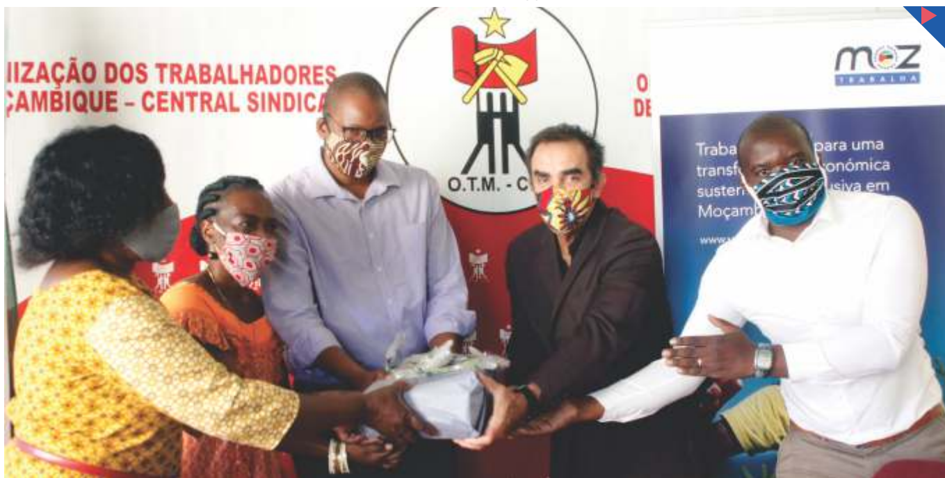
COPODEMO members and ILO staff during the presentation of face masks.

"This initiative is part of the extension of the gender strategy of the Moztrabalha project adapted to COVID-19. Under this adapted strategy, Moztrabalha is working with the social partners in a set of actions aimed at supporting various associations and women businesses and entrepreneurship by reorienting them to make products that can be used to protect or mitigate the impacts of COVID-19 while protecting jobs and providing income for their workers in these difficult times" explained Simbine.