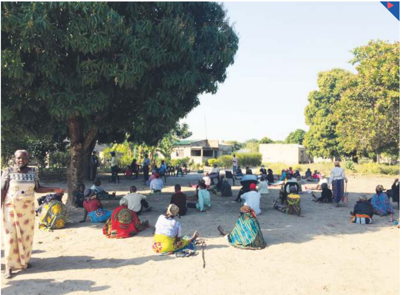
A group of potential beneficiaries of PASD-PE “pandemics” programme are awaiting to be enrolled by National Institute of Social Action (INAS).

As a result of ILO's support on policy dialogue, it is important to note that from the households targeted for Phase 1, around 30,000 will be low-income, own account informal workers previously registered at INSS (contributory system), an important step towards improving coordination among contributory and non-contributory sides of the system, enhancing coherence and effectiveness.