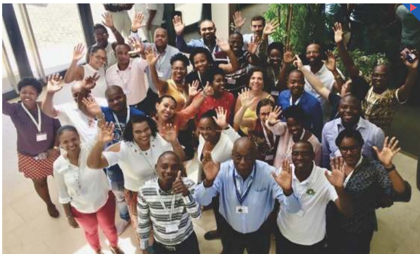
Training course "Statistics on Social Protection in PALOP countries", organized by ILO-ITC in close collaboration with ILO Office in Maputo and ILO Office in Cabo Verde, under the framework of the ACTION/Portugal project. Praia, Cabo Verde, September 2019.

protection. This outcome demonstrates that tangible and strategic results can be achieved when capacities and efforts are combined in a concerted manner, articulating and combining training and capacity-building actions with technical support provided by ILO Social Protection team in Maputo for the Inter-institutional Working Group created in Mozambique. This document is the result of hard work by the technicians and statisticians of the various institutions involved, with technical and financial support from the ILO, and provides an opportunity for effectively broadening the scope of the Social Protection system in Mozambique. Conscious of the paramount importance of having robust, reliable and consistent statistical data to guide well-informed decision-making for the consolidation of a Social Protection Floor in Mozambique, the ILO consider the technical and financial support of the ACTION/Portugal Project to be essential for continuing the work of strengthening institutional capacity for processing statistical social protection data in Mozambique.