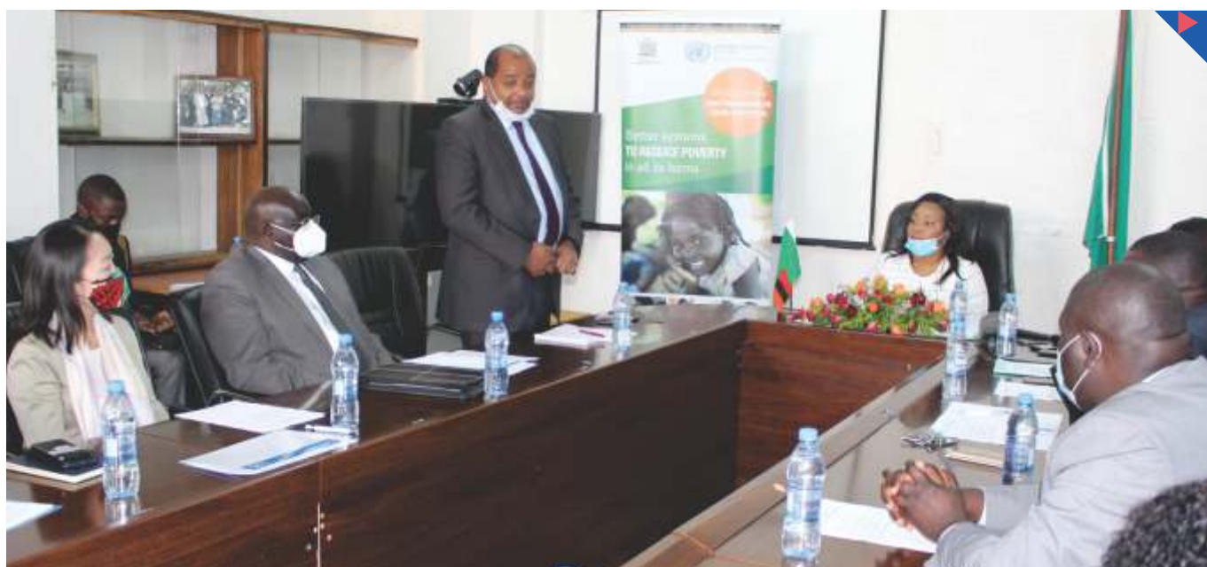
Minister of Community Development and Social Services Kampamba Mulenga - Chewe (centre) with UN Agencies representatives during the press briefing on the launch of the COVID-19 ECT programme in Lusaka.

Meanwhile, UNICEF Country Representative Noala Skinner has hailed the partnership between the Government, the donors and the UN Agencies in enhancing social protection and ensuring a shock-responsive social protection system that can respond, like in these difficult COVID-19 times, to worsening vulnerabilities among Zambians.