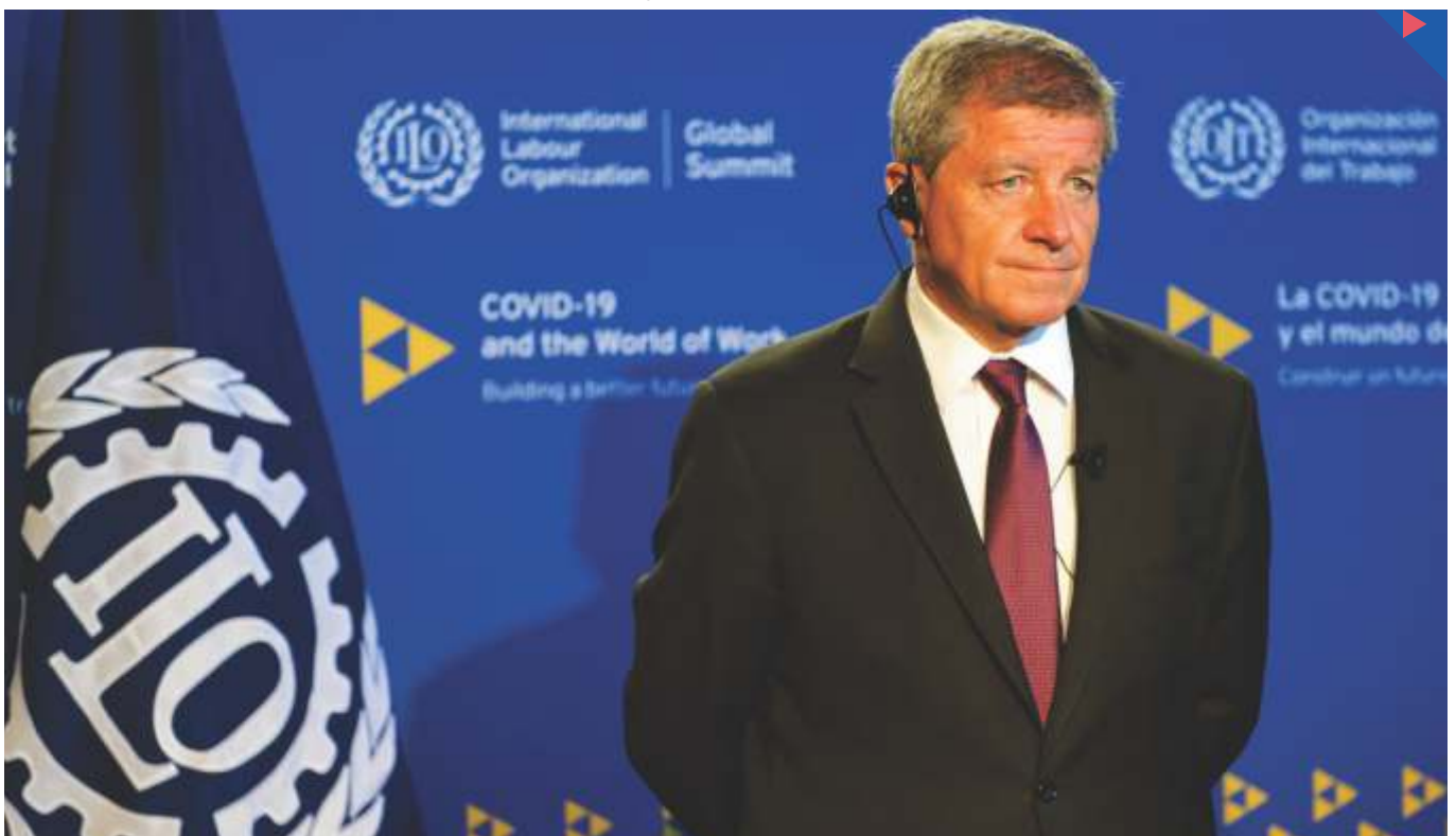
Mr. Guy Ryder during the opening session of the Global Summit.

"Firstly, we had those five Regional Events, and you know the regions really stepped up with those events and made them a great success. And then in the last few days we've had three Global days the regional reporting back, the leader's day when 80 global leaders', Heads of State, Heads of Government, Heads of Workers' and Employers' organizations, leaders of international organizations, brought their messages to the ILO about the challenges of the pandemic and what we must do about it," he stated. "And then we finished, as I think was appropriate, with a tripartite constituent's day which brought together what we think and what they think the ILO must be doing to overcome the pandemic. You know this is going to serve us very, very, well in the future because you've all contributed through the summit to increasing the connectivity of the ILO."