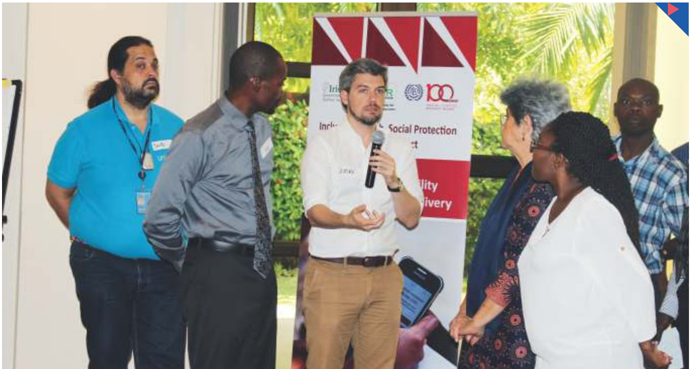
Part of the participants of the workshop.

The workshop succeeded in renewing enthusiasm amongst its core members. It highlighted challenges ahead in terms of resources constraints but also confirmed the team spirit behind this pioneering inter-agency initiative. It served as a powerful reminder that TRANSFORM was borne out of the sheer determination of experts and agencies active in social protection to push forward the achievement of the Leave No One Behind Agenda across Africa.