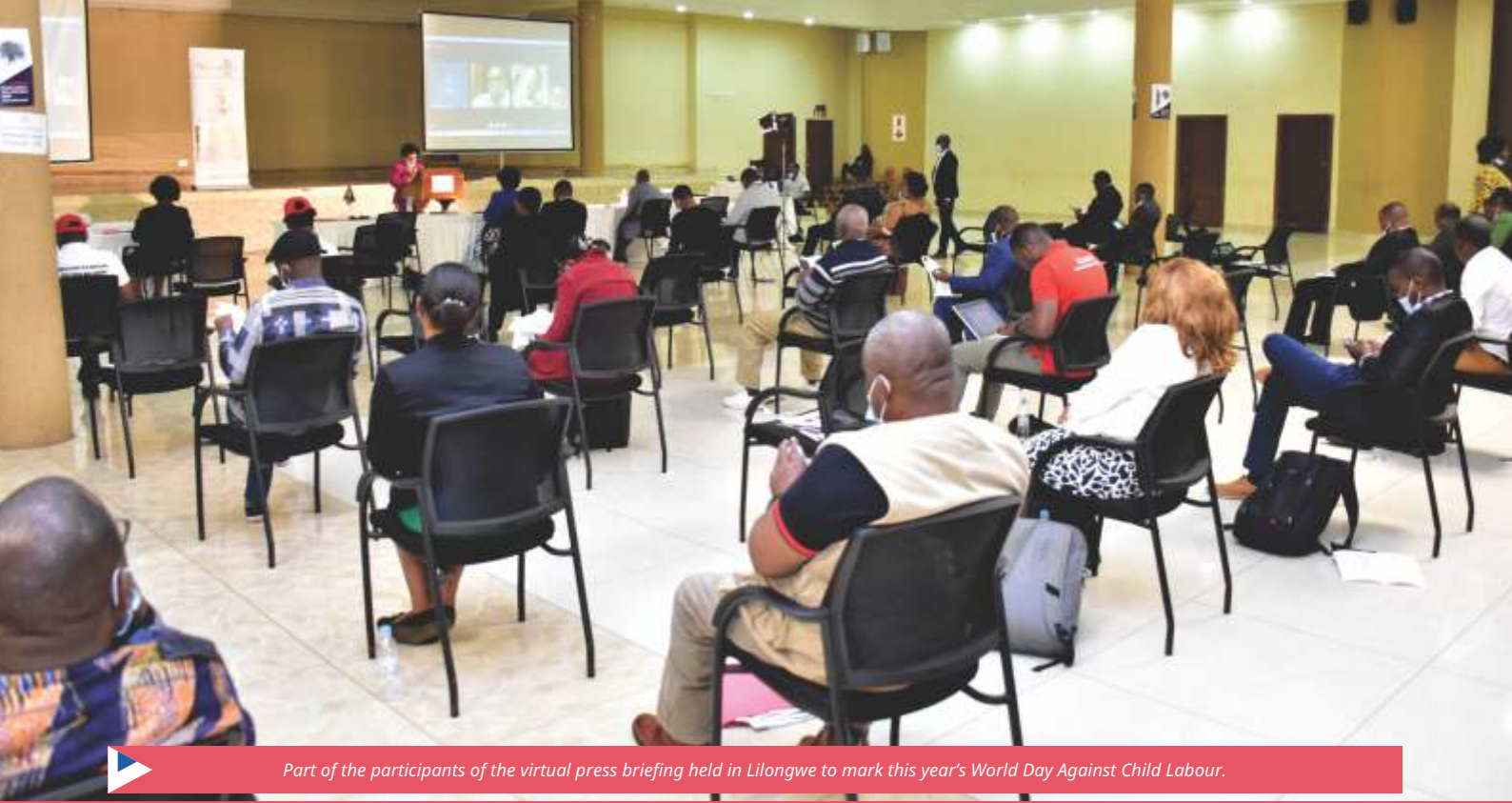
Part of the participants of the virtual press briefing held in Lilongwe to mark this year's World Day Against Child Labour.