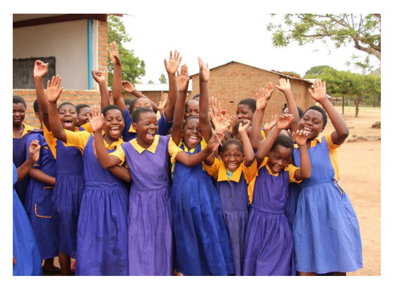
Beneficiary narrates how SI has impacted her life in Ntchisi.

By clearly defining milestones, targets and key performance indicators for the DaO approach, the UN team will be able to jointly monitor and track progress in its application, and easily identify bottlenecks as they arrive. This framework also serves as an accountability tool, ensuring that RUNOs/RCO are accountable to one another as members of the JP team, and that they have a concrete reference point in holding each other accountable. The framework will furthermore build