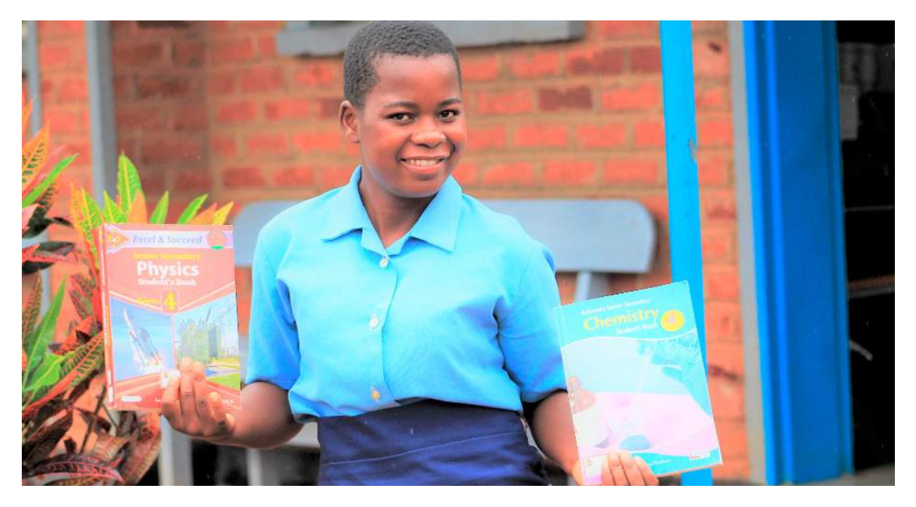
Girls belong in class, a scholarship beneficiary in Dowa district.

In response to the restrictions during the peak of the COVID-19 pandemic, the SI brought onboard the mobile-based organization VIAMO, tasked with supporting training and awareness interventions through mobile platforms.