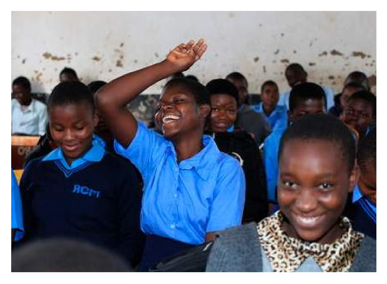
SI Scholarship beneficiaries interact during a class session.