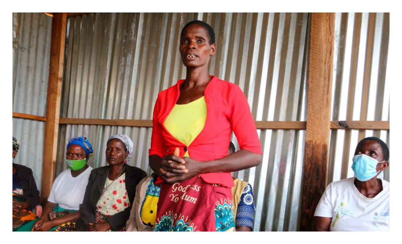
Traditional leaders interact during a chiefs forum in Ntchisi.

Women's grassroots organisations are more knowledgeable on SRHR and are better able to advocate for their rights and develop/ implement plans to enhance their SRHR. In keeping with the LNOB principle the SI created and strengthened networks of female sex workers (FSWs), and Women Living with HIV and AIDS, and trained them on their SRHR, prompting them to raise awareness and improve uptake of SRH services among members of this especially vulnerable group.