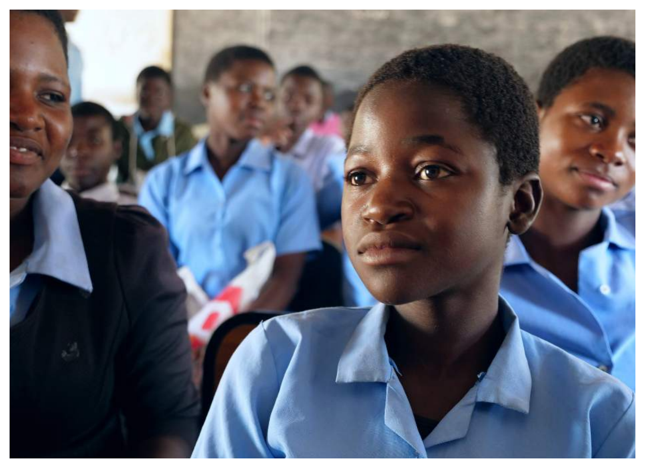
A class session with some of SI scholarship beneficiaries at Mvera Community Day Secondary School.

The roles of Chiefs, community leaders, and CBOs were also unexpectedly reinforced when travel restrictions required the UN team to rely on these actors for continued reporting and referrals of SGBV/HP cases.