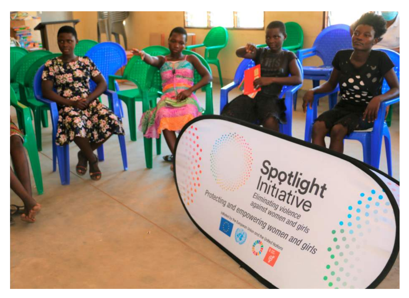
Beneficiaries interact during a mentorship session in NkhataBay District.

At both national and district levels, the SI is strategically positioned under the Gender Technical Working Groups (GTWGs). At national level, the Gender and Human Rights Working Group (GHRWG) has a standing agenda item for the SI, during which key updates are shared with the group. This arrangement reflects the spirit of UN Reform by allowing the SI to be part of broader gender and human rights discussions, which in turn ensures greater complementarity at the inter-agency level, and facilitates holistic and multi-lateral decision making for the SI. At district level, the COPs jointly report to the GTWGs which are also being strengthened through Pillar 2.